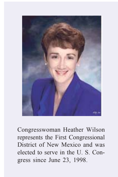
Congresswoman Heather Wilson represents the First Congressional District of New Mexico and was elected to serve in the U. S. Congress since June 23, 1998.

Congresswoman Heather Wilson (R-NM), was asked about what she considered the federal role in supporting technology transfer. She stated that it was not the government's role to create wealth although it should create conditions to attract small businesses and create jobs. The government has invested in research and development. It is the private companies that have the ability to license the technology and to accomplish it easily. As the Representative Wilson pointed out, New Mexico is home to two national installations (Kirkland Air Force Base and the Sandia National Laboratory) that combined generate about $3.5 billion in research and development dollars yearly. The ability to license this technology for other applications and get it into the market place is best done by the private sector. The best incentive government provides for economic development is to make available academic resources that assures American citizens are educated. An intelligent workforce translates into wealth in a 21 st century global environment.